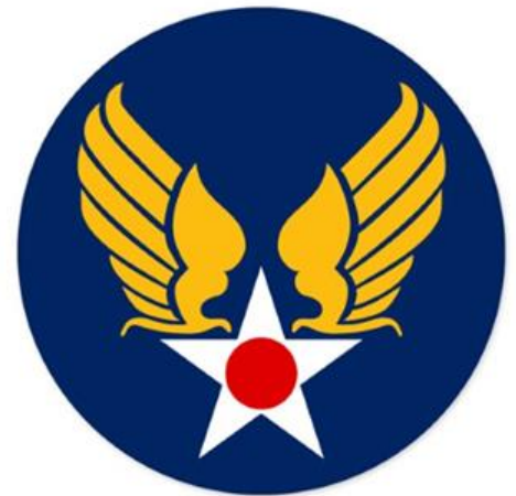
1941 UNITED STATES ARMY AIR FORCE